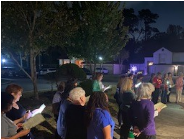
Caroling all the way!