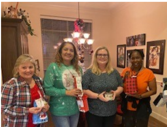
All the BIG winners!