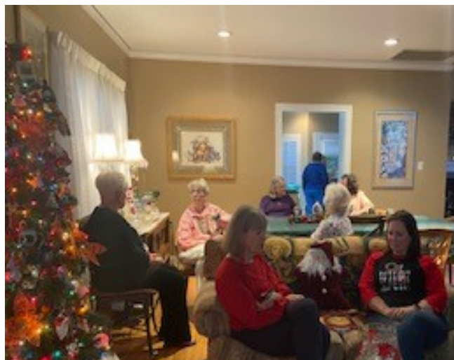
Visiting with friends!